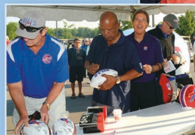
Special appearances by